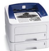
Phaser 3250 shown with optional Tray 2