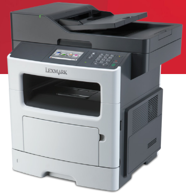
MX510de / MX511de/dhe