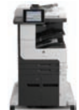
HP LaserJet Enterprise MFP M725z+