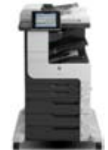
HP LaserJet Enterprise MFP M725z