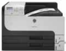
(HP LaserJet Enterprise 700 Printer M712dn)