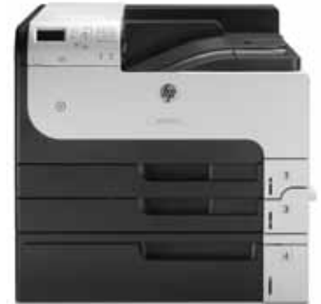
(HP LaserJet Enterprise 700 Printer M712xh)

Mobile printing capability: HP ePrint, Apple AirPrint™