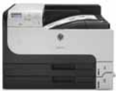
(HP LaserJet Enterprise 700 Printer M712n)