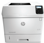
HP LaserJet Enterprise M604dn