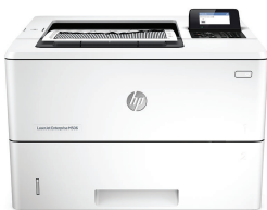
HP LaserJet Enterprise M506dn