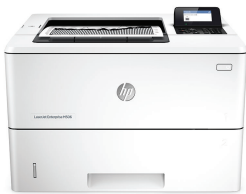
HP LaserJet Enterprise M506dh