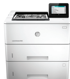
HP LaserJet Enterprise M506x