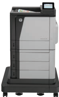
HP Color LaserJet Enterprise M651xh