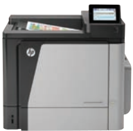
HP Color LaserJet Enterprise M651dn