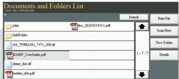
View of existing documents and folders on the MFP control panel

Mission-critical sales presentations, advertising campaign materials, new product launch plans, and many other documents are meant to be shared; delays are not an option. So in today's fast-paced, competitive business world, people must have timely access to information. With KYOCERA's SharePoint Connector you have an enterprise-wide conduit to SharePoint 4.0, one that facilitates the flow of vital information – the information that powers your business.