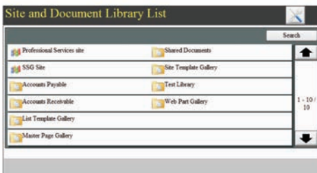
View available SharePoint sites and document libraries on the MFP control panel