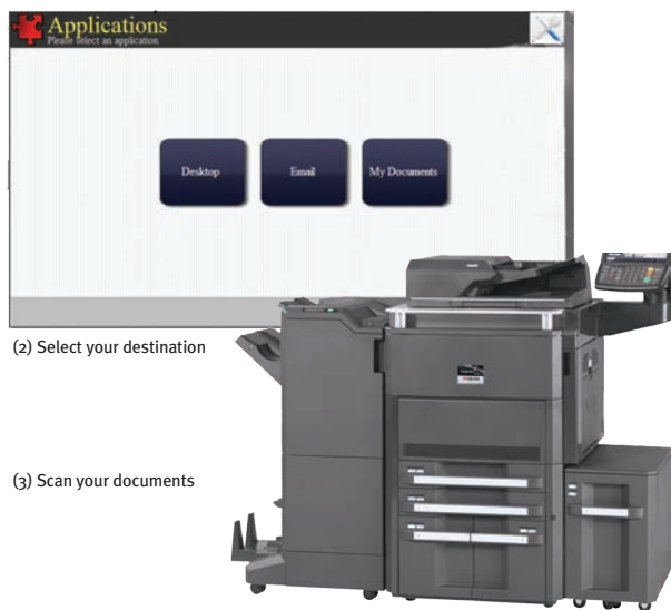
(2) Select your destination