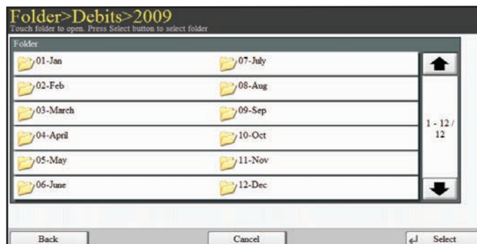
(1.) Choose a destination at the MFP panel

KYOCERA's HyPAS (Hybrid Platform for Advanced Solutions) is a powerful and scalable software solution platform. Through direct enhancement of the MFP's core capabilities, to the integration with widely accepted software applications, HyPAS will enhance your specific document imaging needs, resulting in improved information sharing, resource optimization and document workflows.