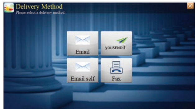
Multiple delivery options for users, based on preference

In today's increasingly fast-paced business environment, factors such as mobility, cost savings, and the need for faster turnaround times have resulted in many businesses using digital solutions as the preferred method for sending documents to customers and co-workers. The e-mail size restrictions of many servers, however, has made sending large files difficult, requiring complicated and time-consuming ways to get them to their destination. KYOCERA offers a simple solution to transform large hard copy documents into digital files that can be sent quickly and easily, regardless of file size, using your existing KYOCERA MFP.